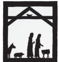
Come to the True Light