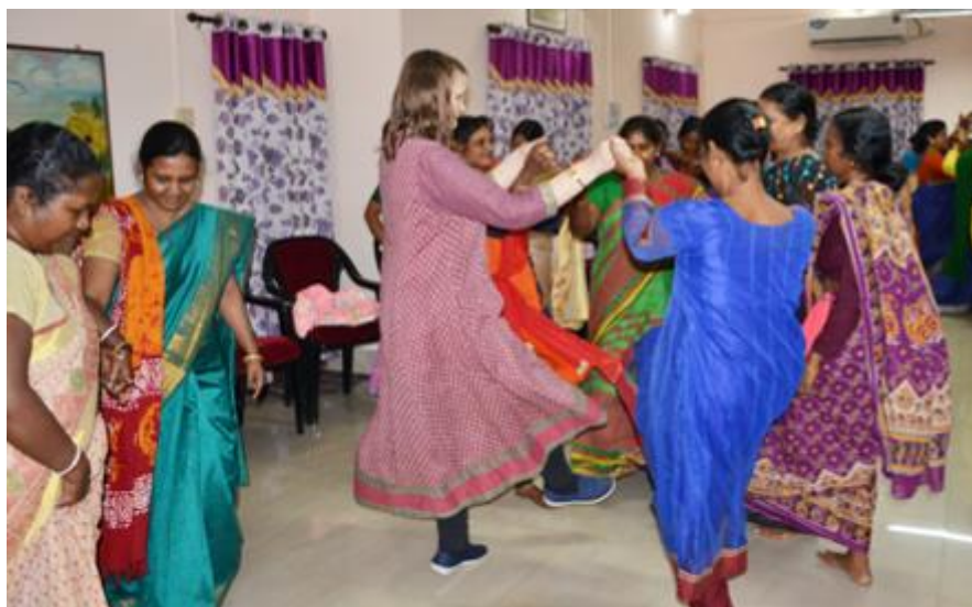
Tribal dancing at the Convention