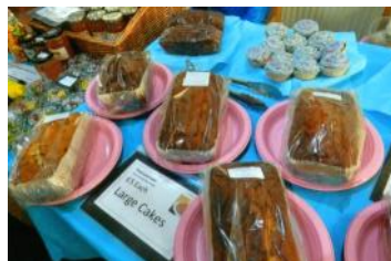
Lots of yummy cakes!

Here are some pictures and an article from the Woking News & Mail .